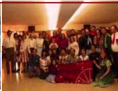
At Rutgers Promenaders in Cherry Hill, NJ in 2005