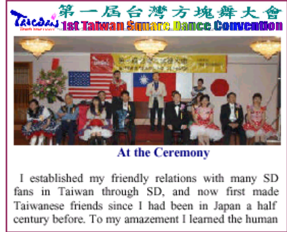
At the 1 st Taiwan Square Dance Convention 2003 in Taipei, R.O.C