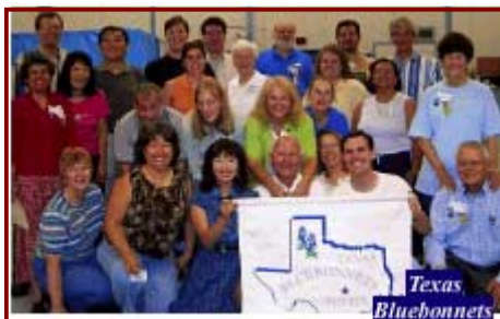
At Texas Bluebonnets in Austin, TX in 2005

Some of our club members have enjoyed dancing with square dance friends at every corner of the world.