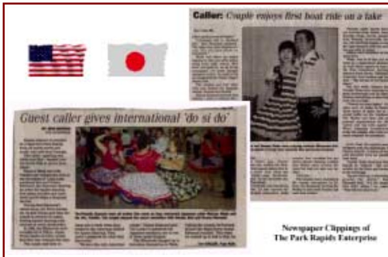
At "Friendly Squares" in Park Rapids, MN in 2002