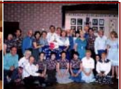
At Gemini Square in London, U.K. in 2001