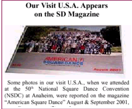
Square Dance Tour 2001 for the 50 th NSDC in Anaheim, CA