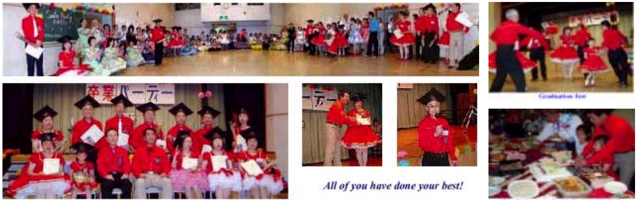
All of you have done your best!

We are also celebrating our [Anniversary] at the beginning of October every year. The year 2002 marked our 40 th anniversary.